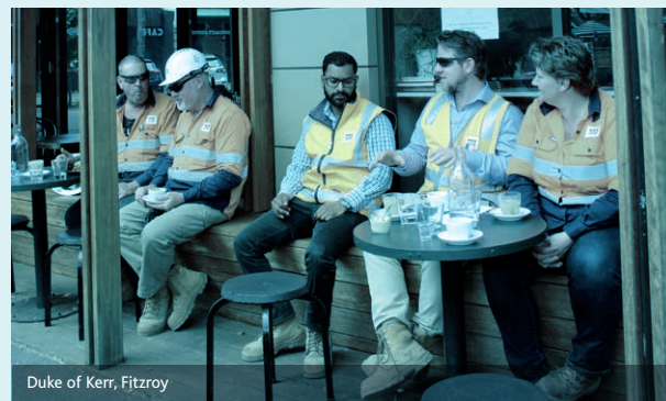
Duke of Kerr, Fitzroy

Local businesses are the backbone of the community and the project team appreciate their understanding while works have been carried out. The project is committed to supporting local businesses who are directly impacted by construction activities and will continue to do so while our works continue.