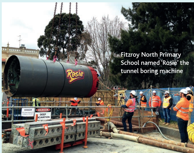
Fitzroy North Primary School named 'Rosie' the tunnel boring machine

At Melbourne Water we understand that our works can be disruptive to local communities and believe it's important to contribute to the communities we're working in. Some of these activities have included: