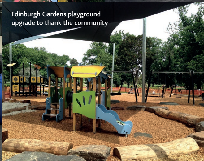
Edinburgh Gardens playground upgrade to thank the community