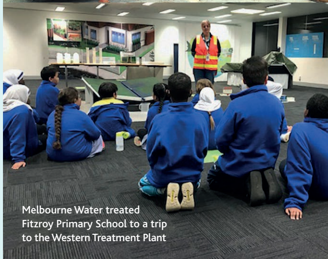
Melbourne Water treated Fitzroy Primary School to a trip to the Western Treatment Plant