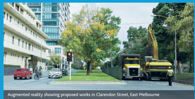
Augmented reality showing proposed works in Clarendon Street, East Melbourne

Community updates will be used to inform residents and businesses directly next to the work areas. Signs will be used around our work areas to inform pedestrians, cyclists and drivers of changes to road conditions. More information and updates will be available on the Melbourne Water website.