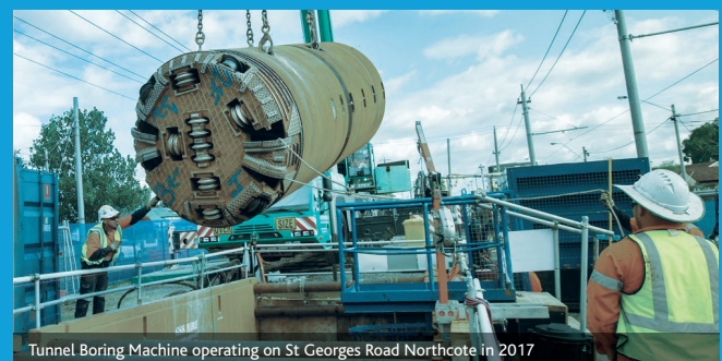
Tunnel Boring Machine operating on St Georges Road Northcote in 2017