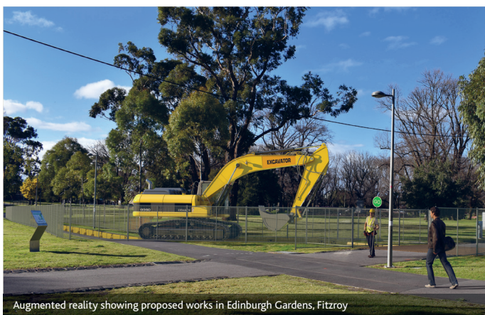
Augmented reality showing proposed works in Edinburgh Gardens, Fitzroy

Melbourne Water and CPB Black and Veatch Joint Venture appreciate your understanding while we replace the M41 water main.