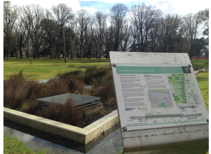
Department of Lands and Survey map including Edinburgh Gardens in 1867 (State Library) and rain garden, Edinburgh Gardens, July 2017

While we will work to avoid or mitigate impacts, Melbourne Water apologises in advance for any community disruption caused by this important work