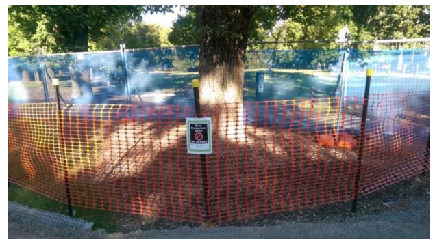
Working in Fawkner Park in 2013 and protecting trees in Fawkner Park during M39 works in 2013