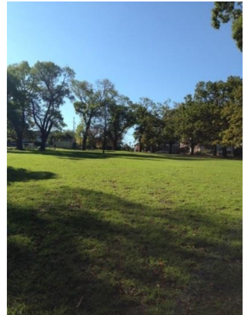
Fawkner Park in 2013 before we started working on the M39 water main and the same area in 2017